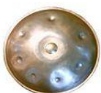
2nd Generation 2006