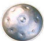
2nd Generation 2007