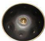
Integral Hang 2008