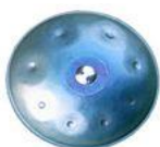
Low Hang 2005