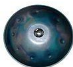
1st Generation 2003

To book cjblundell1@aol.com www.facebook.com/fortbelan